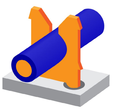
Figure 2 Insulation Displacement Connection [AVX.com]