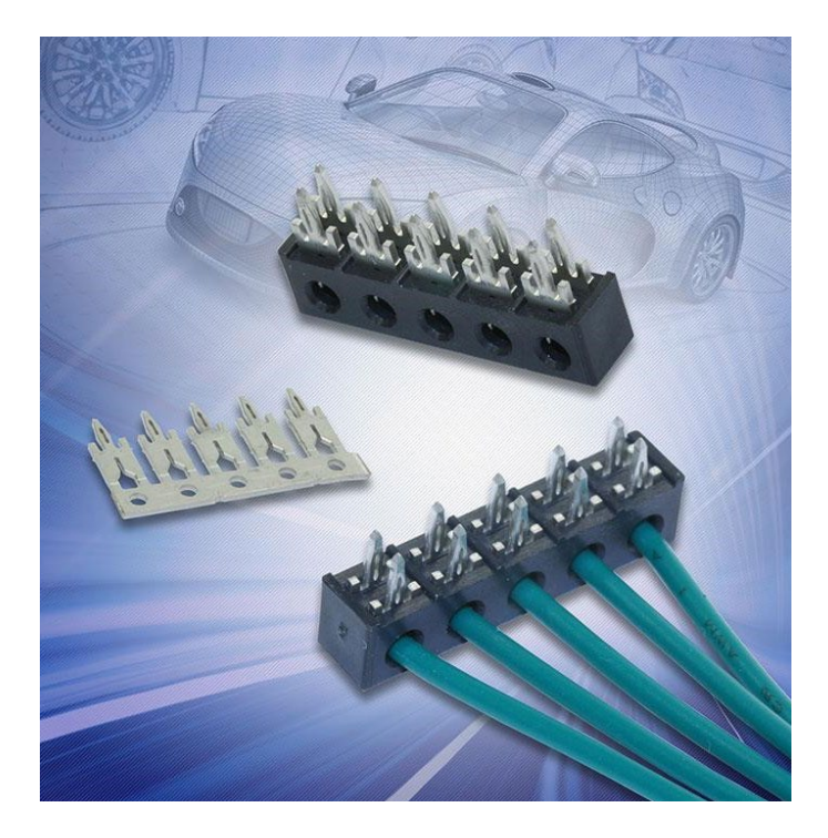
Figure 4 AVX Press-Fit IDC 53-8702

Visit AVX's website for more information.