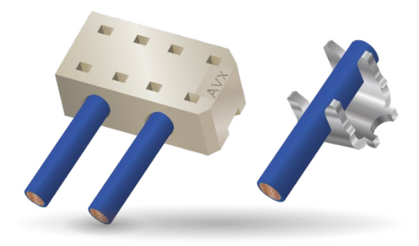
Figure 3 AVX Low Profile IDC Connector

In terms of IDC connectors, AVX has the broadest offering on the market. With over 30 years of experience in connector manufacturing, AVX has IDC connectors that cover a wire gauge range from 12 to 30 AWG across numerous form factors and termination housings. A new development from AVX that is perfectly suited for automotive applications is the low profile IDC connector, shown in the figure below.